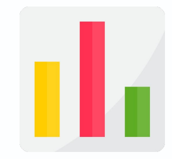
50 in-person sessions ( 45 requested meetings)